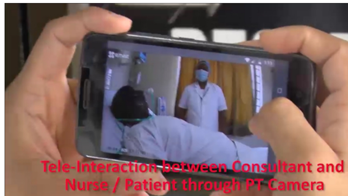
Figure 2: Doctor accessing the camera after installing the application.

The steps of setting up the camera is given in the quick start guide provided with the device, the salient steps include: