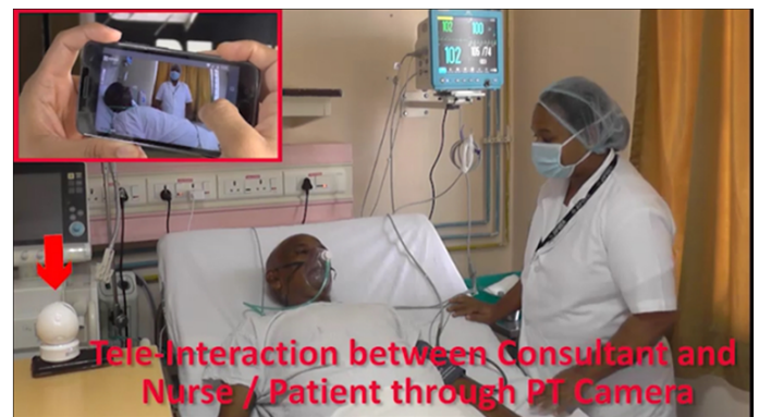
Figure 3: Tele-interaction Session.