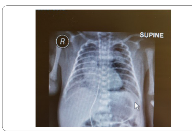
Figure 4: Congenital Lobar Emphysema: preoperative CXR.