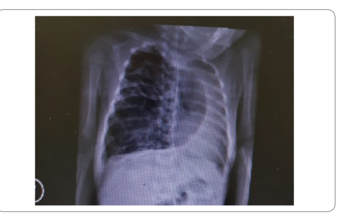
Figure 1: Congenital Cystic Adenomatoid Malformation preoperative CXR.

Two neonates with CCAM were premature having gestation age of 32 and 34 weeks with birth weight of 1.9 Kg each. All other neonates were full term with birth weight ranging from 2.4 to 3 kg. The diagnosis was confirmed on histopathology. All the patients were on ventilatory support during immediate post operative period. The duration of NICU stay was from 1 to 3 weeks. The postoperative course was smooth in all the patients. All the neonates were cured and were discharged home in good health. All the children had a mean follow up of four years. The post operative findings on CXR, CT scan and postoperative CXR of CCAM, CLE and BC are given below (Figure 1-9).