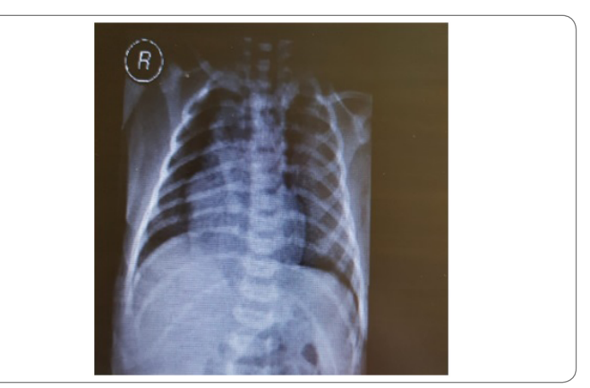
Figure 7: Bronchogenic Cyst: preoperative CXR.