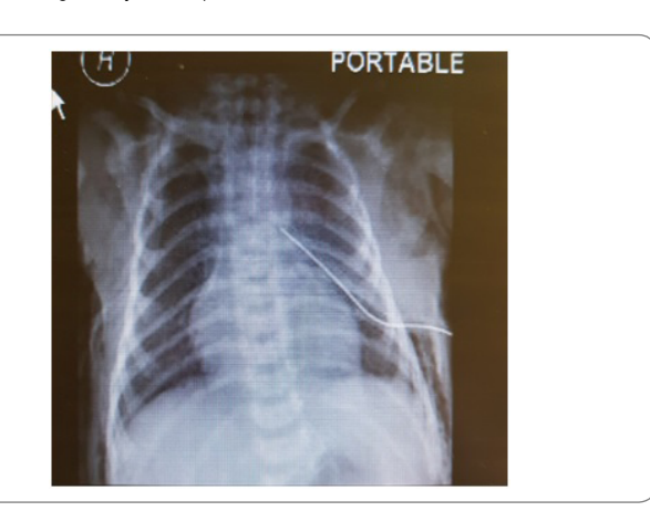
Figure 9: Bronchogenic Cyst: post-operative CXR.