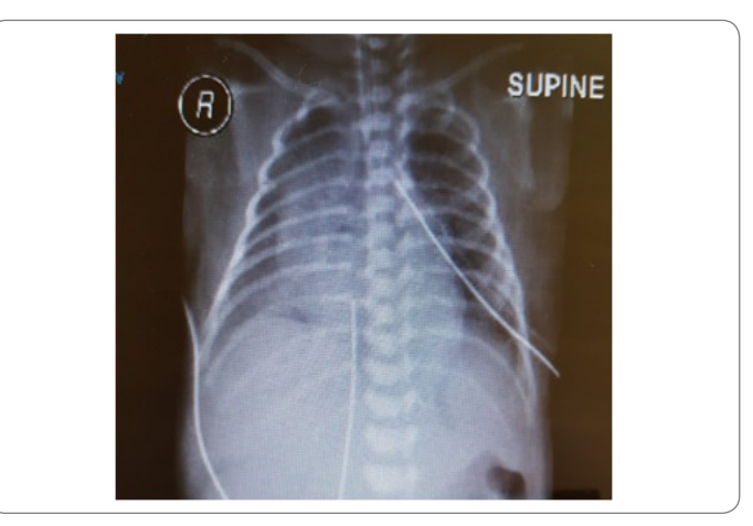
Figure 6: Congenital Lobar Emphysema: post operative CXR.