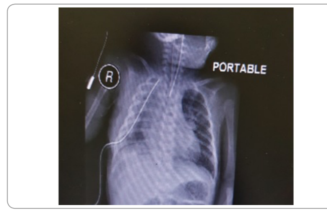
Figure 3: Congenital Cystic Adenomatoid Malformation: post operative CXR.