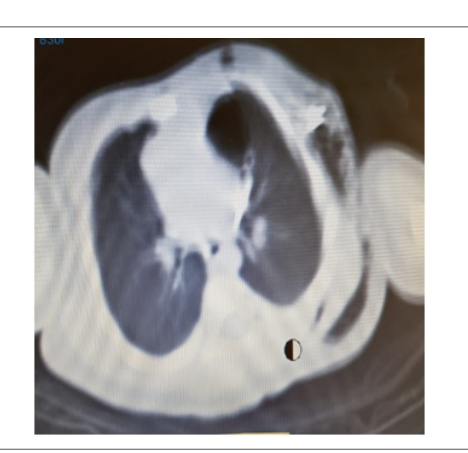
Figure 8: Bronchogenic Cyst: Preoperative CT scan chest.